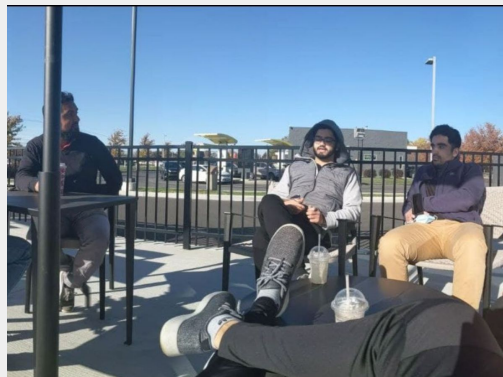
Top to bottom right: Jama'at members offering Tahajjud and Fajr, Khuddam Khidmat-e-Khalq