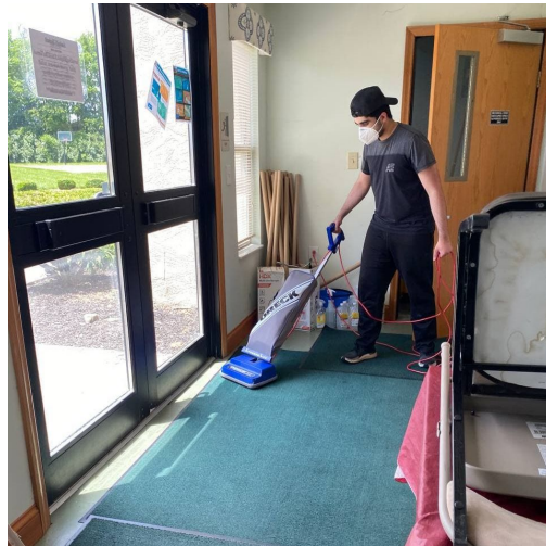
Pictures from top left to bottom right: Community garden, MKA Tabligh event, and MKA Waqare Amal event