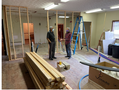
Pictures: Mosque roof replacement (left) and work in progress for Masroor Hall renovation (right)