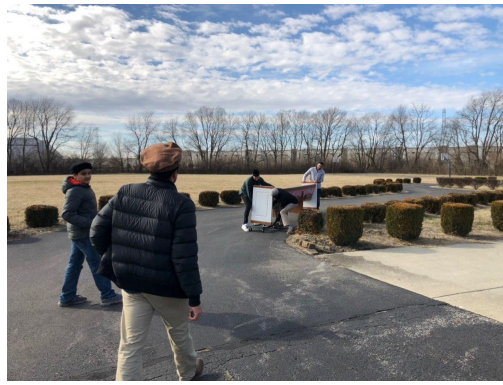
From top to bottom and left to right: Centennial Day celebration, Lajnah lead dinner at homeless shelter, sandwich making for homeless shelter, MKA adopt-a-highway, Lajnah World Hijab day at OSU, and Waqar-e-Amal to remove pews.