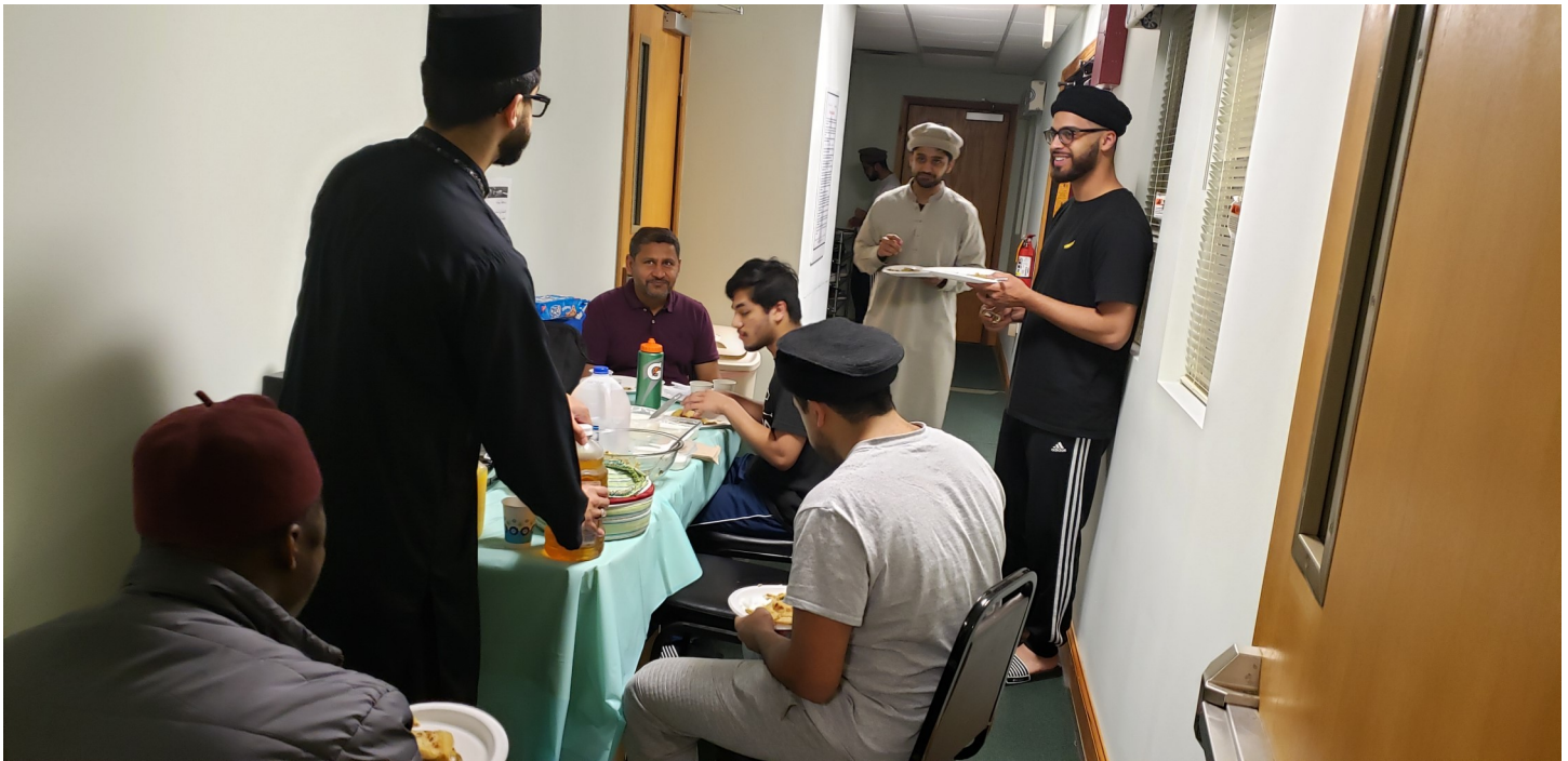
Mu'tikifin (spiritual retreat participants) partaking of Sehri at Baitun Nasir Mosque on June 2, 2019